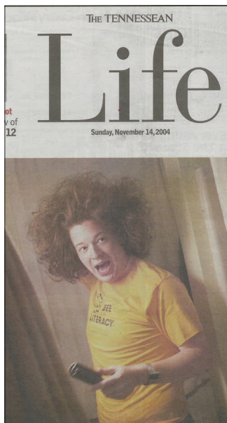
In November, 2004, a sexually confused young man decided he wanted to become the prom queen at Vanderbilt University in Nashville, Tennessee. The local newspaper featured this man in its Sunday edition and portrayed him as being perfectly normal.